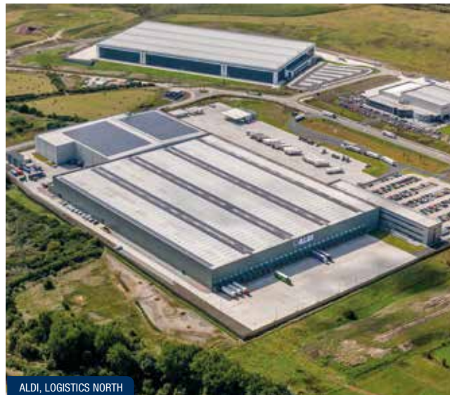
ALDI, LOGISTICS NORTH