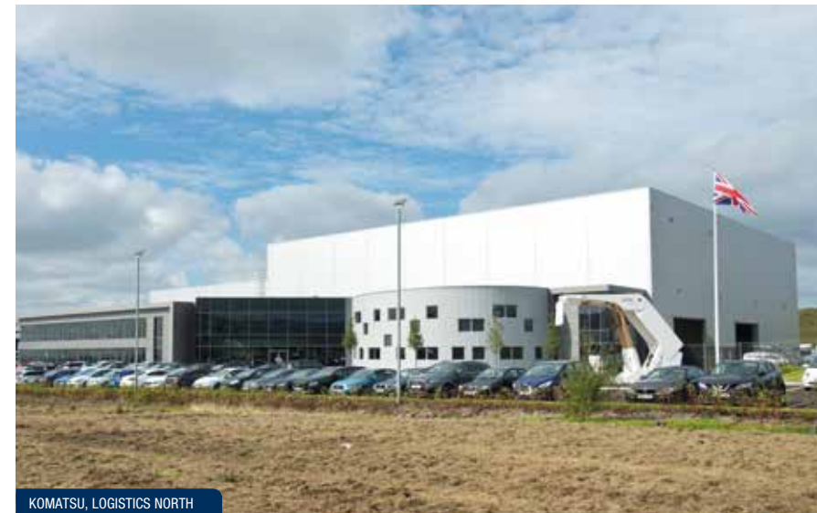
KOMATSU, LOGISTICS NORTH