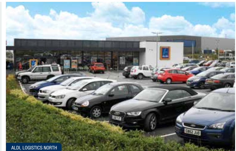
ALDI, LOGISTICS NORTH