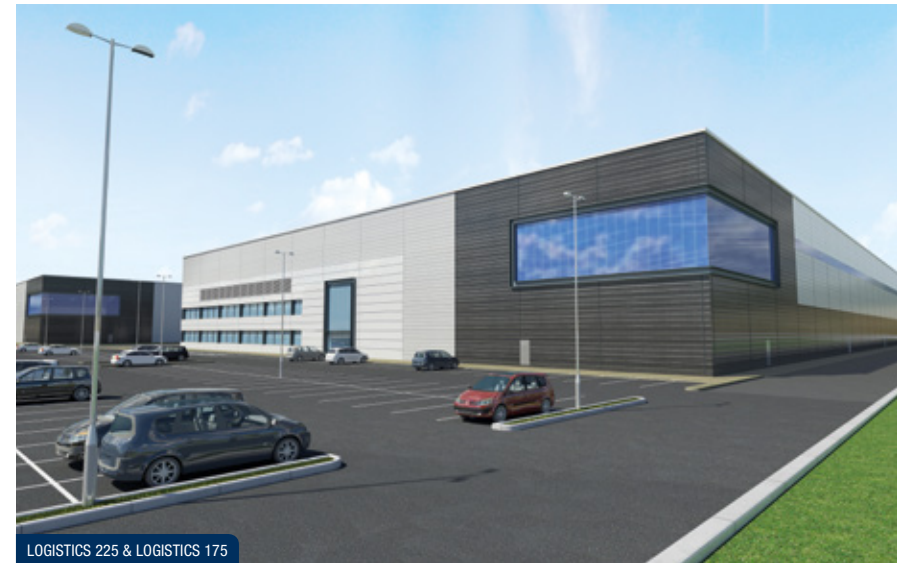
LOGISTICS 225 & LOGISTICS 175