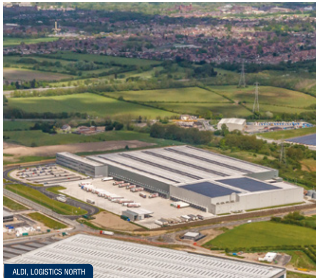
ALDI, LOGISTICS NORTH